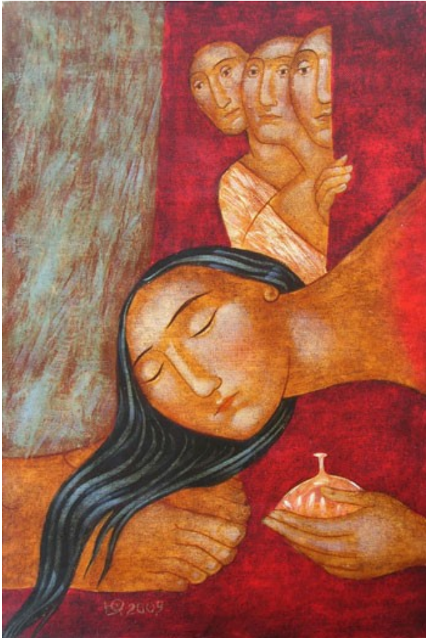
The Anointing of Christ, 2009, Julia Stankova http://www.juliastankova.com/galleries/2009.html