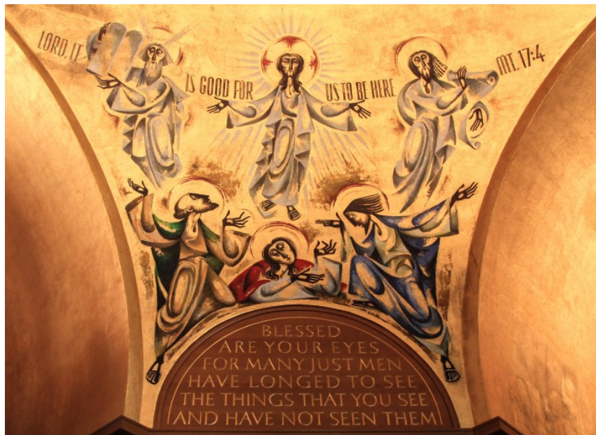
Leandro Miguel Velasco (Colombian, 1933–), The Transfiguration of the Lord . Mural, Great Upper Church Sacristy, Basilica of the National Shrine of the Immaculate Conception, Washington, DC. Photo: Fr. Lawrence Lew, OP. Accessed Feb 19, 2020: https://artandtheology.org/